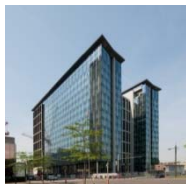
NORTH LIGHT BRUSSEL