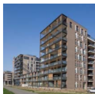
DE ZAAAT TEMSE