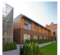
WZC O.L.V. VAN TROOST WESTKAPELLE