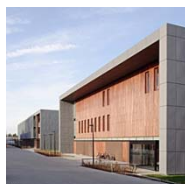
HOWEST - PIH KORTRIJK