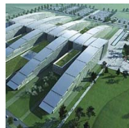
NAVO HQ EVERE