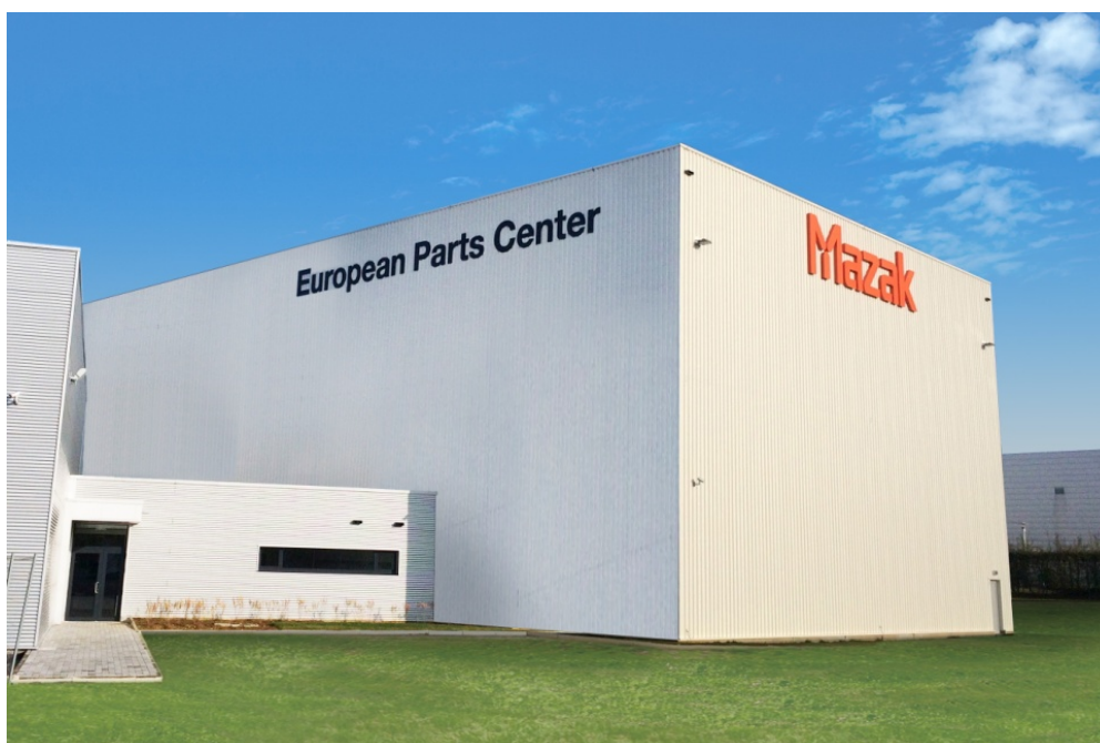
European Parts Center

Contact: Sales Administration Dept, Corporate communications / promotion, YAMAZAKI MAZAK CORPORATION.